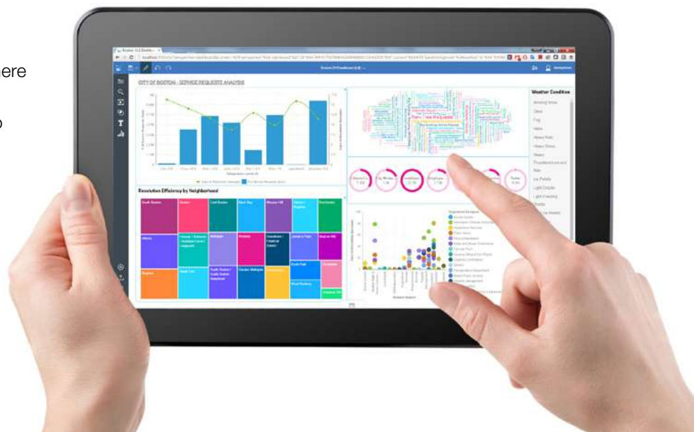
Figure 1. Dramatically increase productivity for departmental and enterprise needs.

Line of business: You want an easy-to-use analytics solution that helps you create great visualizations from virtually any type of data. Cognos Analytics enables bottom-up and top-down collaboration, helping business users to build upon the decisions, data and dashboards of others to create new visual perspectives for others to borrow.